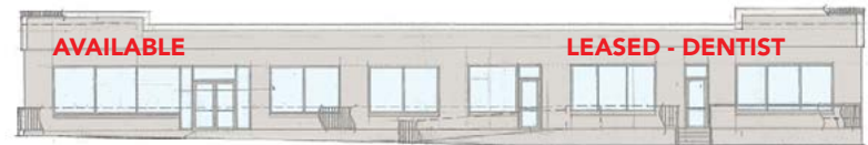
Upgrades to Existing Buildings