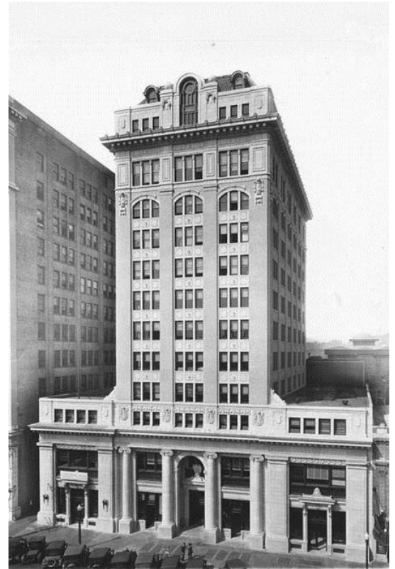
The Maclellan Building, 1925

Keith Hamrick , VP of Retail Services, represented the purchaser in the sale of land located at 145 East Magnolia Place in Auburn, Alabama. The land will be redeveloped for retail use.