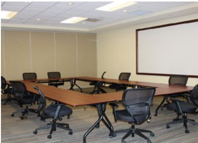
CORPORATE EVENT CENTER