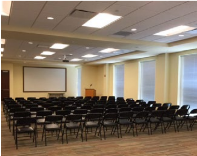
CORPORATE EVENT CENTER