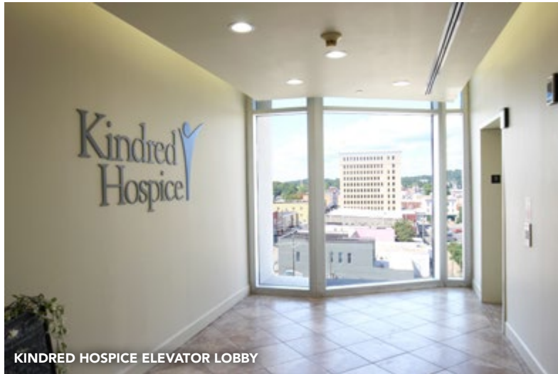
KINDRED HOSPICE ELEVATOR LOBBY