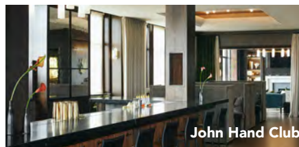
John Hand Club