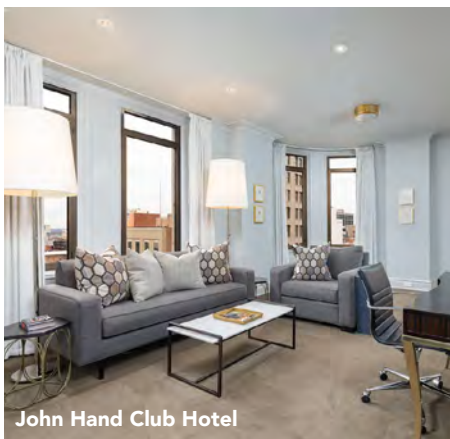
John Hand Club Hotel

HISTORIC BUILDING: John Hand Building was built in 1912