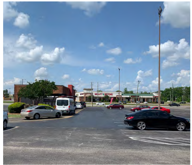
Parking Lot with Wendy's Drive-Thru