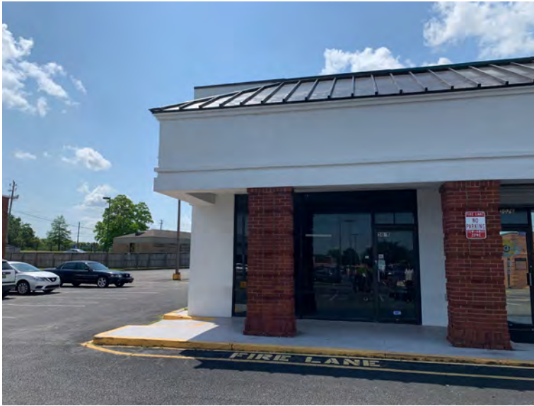
Suite 5052: 1,200 SF

Retail/restaurant space for lease along busy Montgomery, Alabama thoroughfare