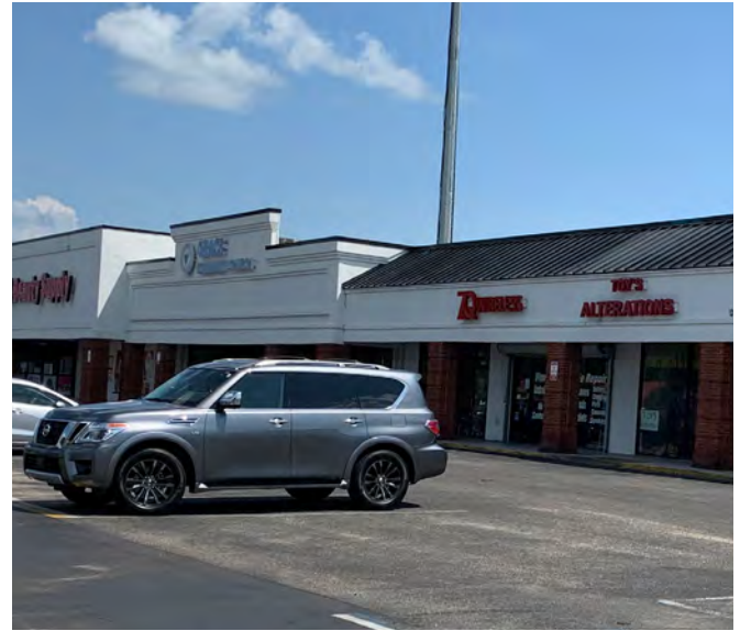
Suite 5028: 1,000 SF