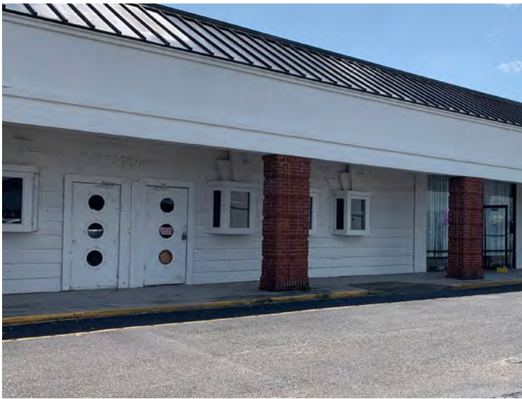
Suite 5040: 3,000 - 6,000 SF (Former bar/grill)