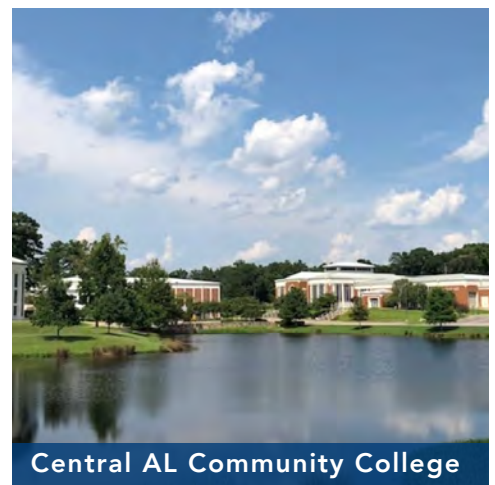
Central AL Community College