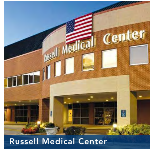
Russell Medical Center