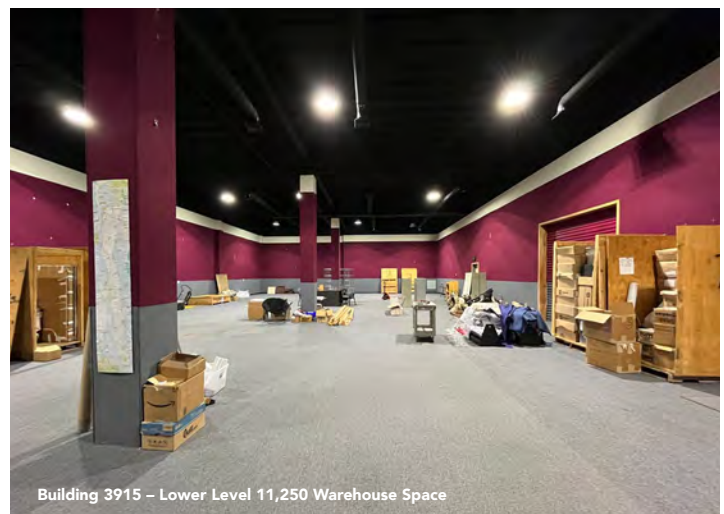
Building 3915 - Lower Level 11,250 Warehouse Space