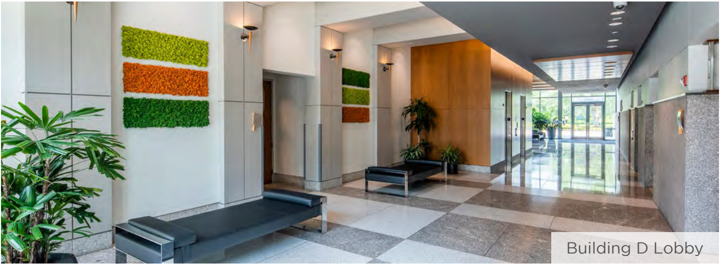
Building D Lobby