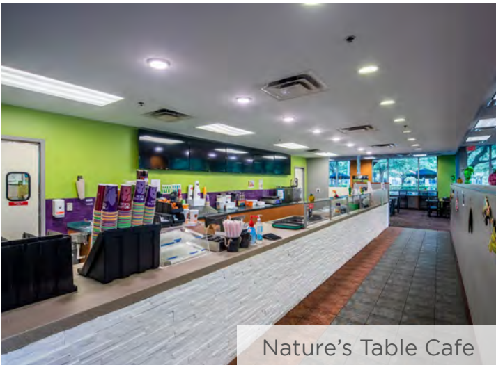
Nature's Table Cafe