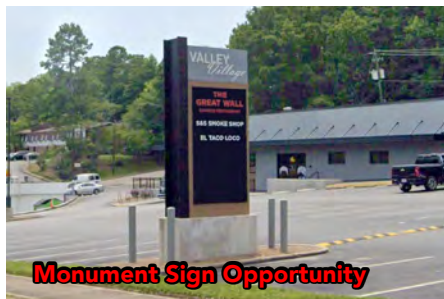
Monument Sign Opportunity

Excellent location along high-traffic road near Homewood Middle School